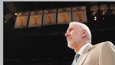
PRINCIPLES OF Gregg Popovich

RELATIONSHIPS: Put People First, Be Honest, Be Fair